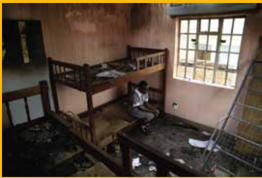
A girl inside once their bedroom