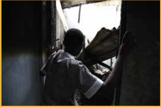
Looking at the future