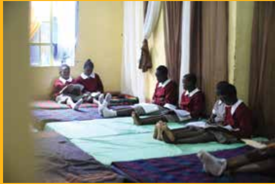
Church where girls are sheltered